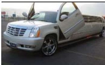
2008 Cadillac Escalade