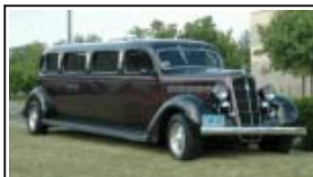
1935 Street Rod Limo

Don't forget to ask about your rides for your Bachelor and Bachelorette parties!