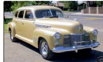
1941 Cadillac Fleetwood